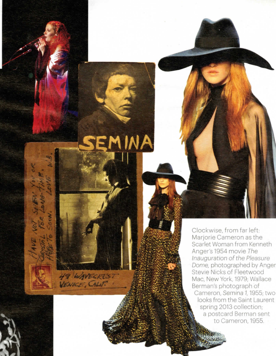
Clockwise, from far left: Marjorie Cameron as the Scarlet Woman from Kenneth Anger's 1954 movie The Inauguration of the Pleasure Dome , photographed by Anger; Stevie Nicks of Fleetwood Mac, New York, 1979; Wallace Berman's photograph of Cameron, Semina 1, 1955; two looks from the Saint Laurent spring 2013 collection; a postcard Berman sent to Cameron, 1955.

Witch's Crew Fiery artist Marjorie Cameron was Los Angeles's original mistress of the occult. A half-century later, says Tim Blanks, the fashion world has fallen under her spell.